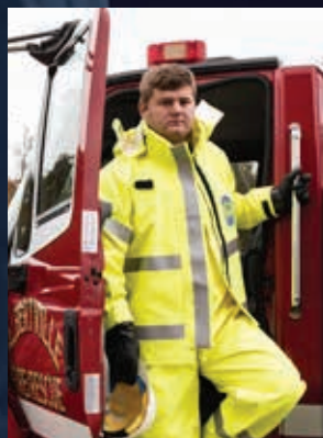
Firefighters can reduce use of expensive turnout gear.