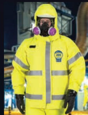
DuraChem 200 is also ideal for industrial work.

Complete technical and chemical test data for the DuraChem