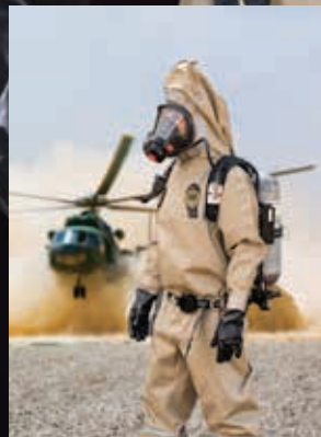
Tan color option is often preferred for Military use.