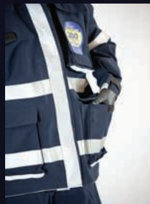
Pockets and equipment loops are popular customizations.