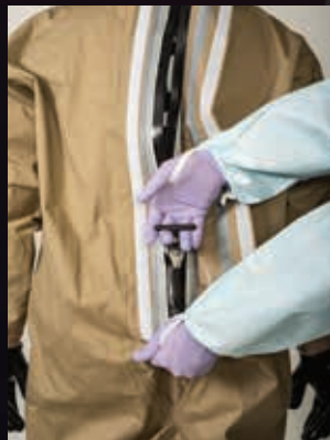
Easy to hold rear zipper aids donning and doffing ergonomics.