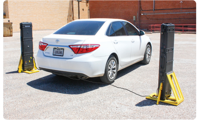
Use as a vehicle monitor (above) or as a personnel monitor (below)